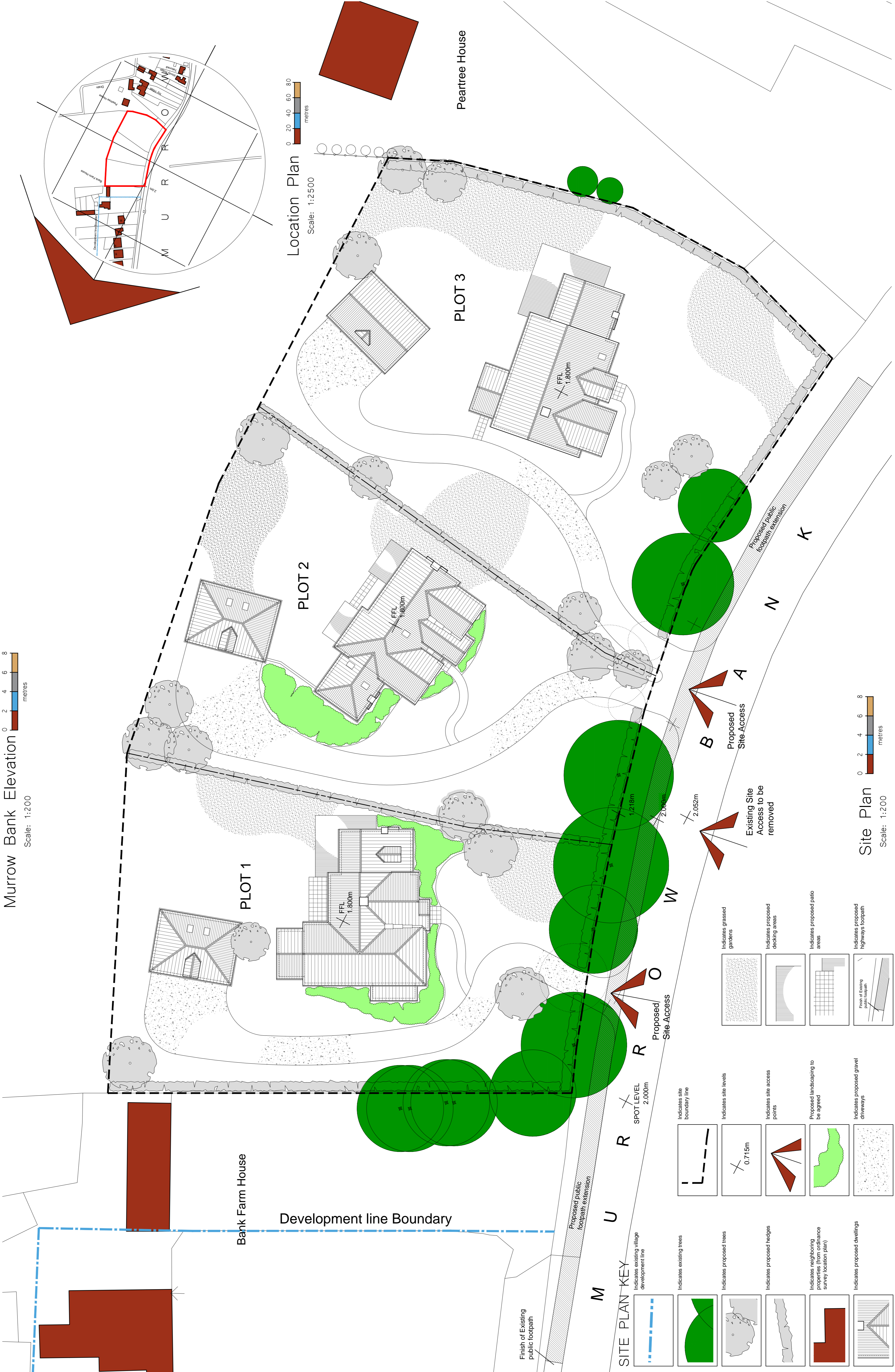
Murrow Bank Elevation Scale: 1:200